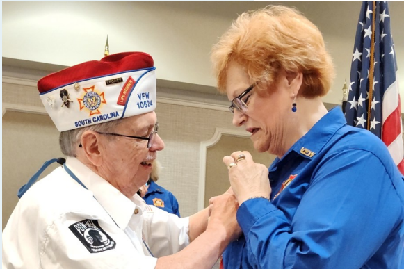
Past President Pinning (they did it on the floor)