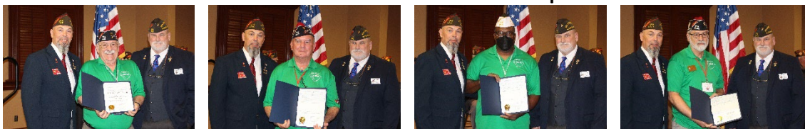
The award winners or their award acceptors

District Early-Bird Awards -Districts 2, 7 and 8 Post Early-Bird Awards- Post 445, 3137, 10811, 12102, 3034