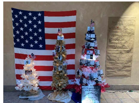
A couple of the Tree of Valor at the Mid-Winter Conference