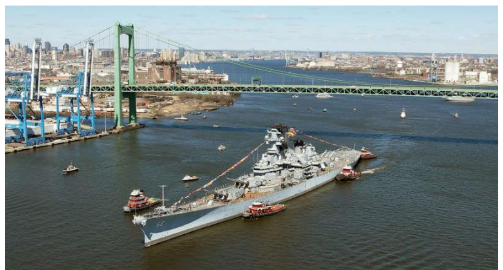
Top picture, the NEW JERSEY in 1942, bottom picture in 2024

What a majestic/nostalgic sight this had to have made as the New Jersey traverses the Delaware River.