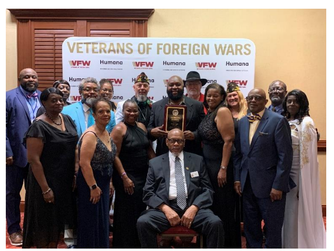
Community Service Post of the Year