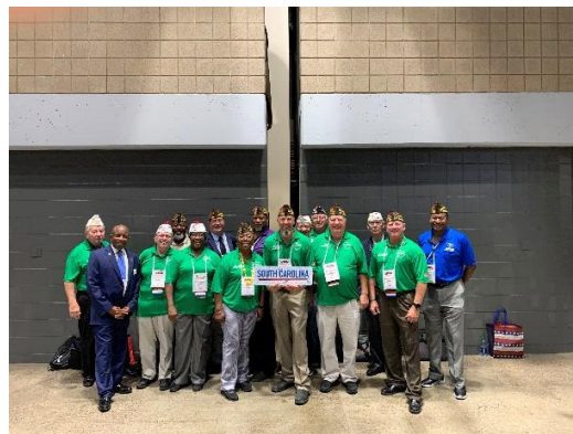
Most of the South Carolina Delegation