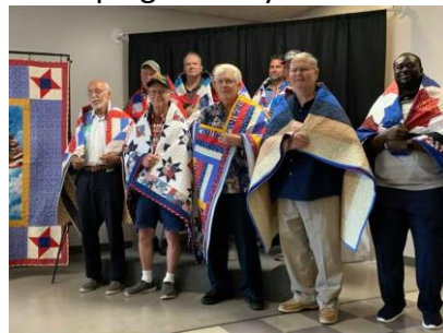
A recent Quilts of Valor presentation at Post 10804

Does YOUR Post or District have a recurring "Special Project"? – North Myrtle Beach Post 10804 has. For the last eight (8) straight months Post 10804 has hosted a Quilts of Valor presentation at their post. Each month, between ten and twenty veterans (most not members of the VFW) receive a Quilt of Valor from the Myrtle Beach Shorebirds, the local Q of V organization. This is not done alone by the Post. It is in cooperation with the local Veterans Welcome Home and Resource Center, the Post Auxiliary (the Auxiliary provides a free lunch to all attendees) and an occasional helping hand by the local Girl Scout Troop.