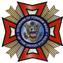
Illustration by Unknown Author is licensed under CC BY 4.0

NOTE: Except for the VVA, no official attendance was reported by any other of the above