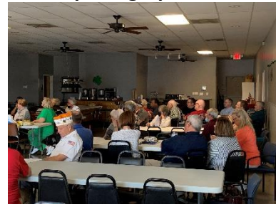
Picture 3: More of the Post & Auxiliary members attending the briefing