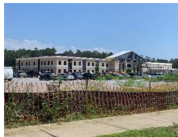
Pictures 1 & 2 are of the new VA Clinic in N. Charleston (Rivers Rd) which will be open this July Picture 3 is of the new Myrtle Beach VA Clinic which opened on April 13 th .

TOMB OF THE UNKNOWN SOLDIER – ARLINGTON: Did you know the Tomb representing Vietnam is empty? It previously housed a Vietnam veteran. In 1998, DoD identified those remains as of an Air Force pilot shot down over An Loc Vietnam in 1972. Those remains were turned over to the deceased veteran’s family. The Tomb remains empty today for all the missing troops of the Vietnam War.