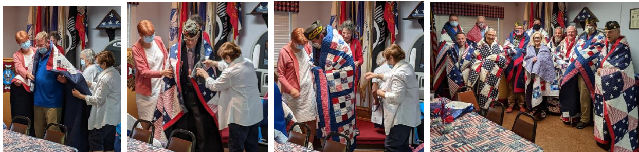
POST 10624 Quilts of Valor Ceremony

***For all you newly elected and pre-existing commanders, senior officers and committee chairpersons – A committee chairperson, when asked to provide an input for the previous edition of the SENTINEL Newsletter, related to me that she often forgot that it was necessary for the VFW to ADVERTISE their good deeds!