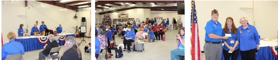
Joint session with presentation of Post 2889 check to the Department

Sights around the April 10 CofA – Also, there were many who earned recognition/awards but were not present to receive their recognition. Pictured below are this events presenters and those accepting awards for themselves or others not in attendance.