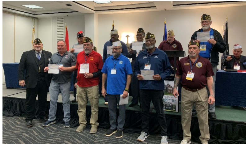
Golden Pen Awardee: Post 10256, Goose Creek