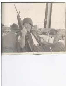
EX: Me in Cam Rahn Bay, RVN Air Traffic Control Tower sometime in 1970 USAF 3-66 to 11-87

Dress & Appearance – As an elected officer at Post, District, or Department level. YOU should be setting an example for the rest of the membership by dressing in a way that is respectful to your position and the VFW. When attending official meetings, you should be wearing some sort of VFW shirt and long pants, along with the appropriate VFW cap. When attending a Department level meeting, the Department Commander usually sets the uniform to be worn (generally decided by what time of year it is). Manual of Procedures, ARTICLE VIII, Section 803 outlines acceptable VFW clothing/hat wear. By wearing appropriate VFW attire, you show the rest of the membership that you are an elected leader. You set the example for respect of the VFW and what it stands for.