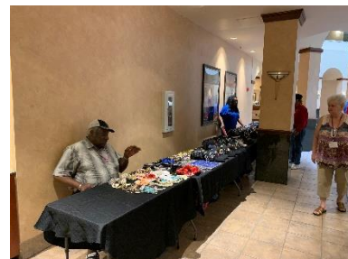
A couple of our usual vendors and the registration table