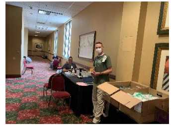
COVID shots were being offered. A couple of our "brave" takers