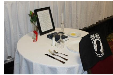
R E S P E C T for those veterans who could not be here