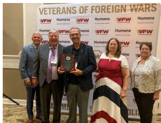
COMMANDER RECOGNITION & OTHER AWARD WINNERS