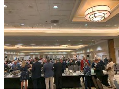
It was a 'full-house' banquet with the guest of honor being a WWII veteran (picture 2)