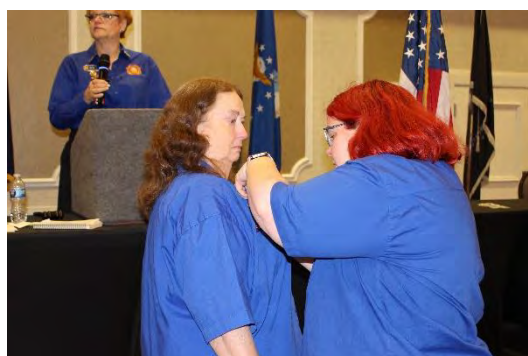
Receiving their Past Commander/Past President pins