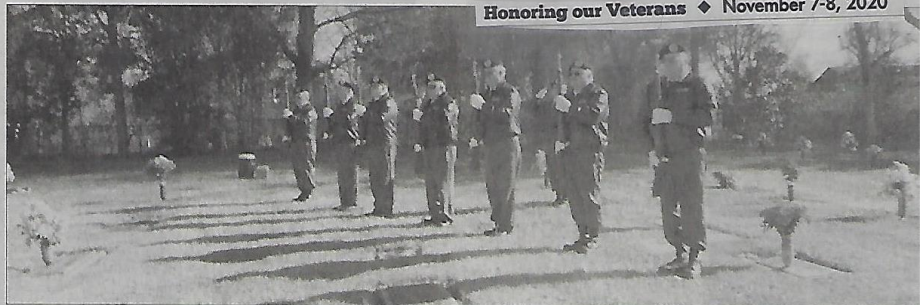
Honoring our Veterans ♦ November 7-8, 2020

Anyone who served honorably in any branch of the United States military is eligible for military funeral honors. In most cases, a two-soldier detail from the deceased's branch of service per-