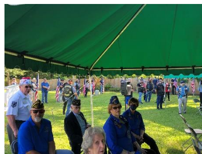
Picture 3: Some state VFW members who, on September 5 th , attended the burial of an ‘Unclaimed Veteran’

Are you aware? – That the first National Cemetery in the state of Wyoming is now open!