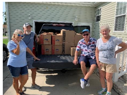
Country Lakes loading crew