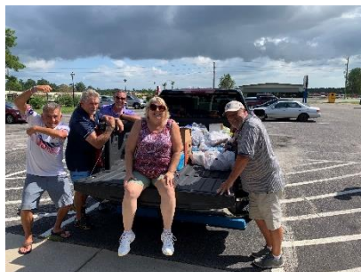
Part of Post 10804/Auxiliary loading crew