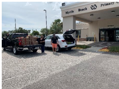
Me delivering food to VA Clinic

** Below is me (Bill La Monte) – delivering 1,000+ pounds of non-perishables and some clothing items that were collected between a food drive at Post 10804, the Auxiliary and the Post Golf League (Post 10804 contributed over 400 pounds and $ 280 in cash and gift cards). Additionally I put out a “HELP” request for food in the community in which I live (Country Lakes, Little River). They responded with over 700 pounds of food and some necessary clothing items requested by the VA Clinic in Myrtle Beach. All told, over $5,000 (VA estimate) in food and clothing was donated by the two groups to the VA Clinic’s “Curbside Pickup” Food Bank. Delivery was made to the VA Clinic a scant 5 days after I received their request for help from them.