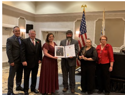
Smart/Maher VFW National Citizenship Education Teacher Award VFW Dept. of SC First Place: