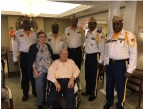
Post Honor Guard pays tribute to a disabled Vietnam veteran and his wife at a recent post Function.