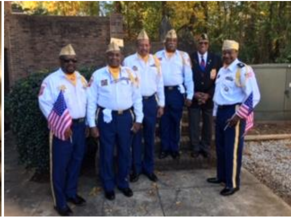
Post Honor Guard prepares for Veteran's Day activities.