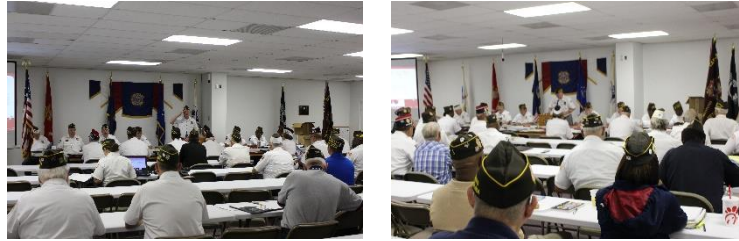
Some of the attendance at the CofA and Sol in August

On August 10 th the Department held a Council of Administration and School of Instruction at Department Headquarters. The following covers most of what transpired at these meetings: